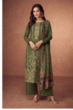
TABRIZ - 81005