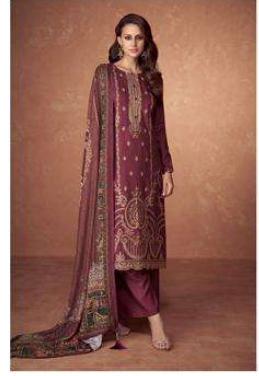
TABRIZ - 81006