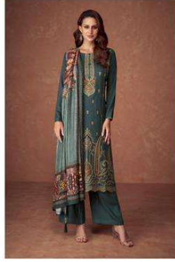
TABRIZ - 81002