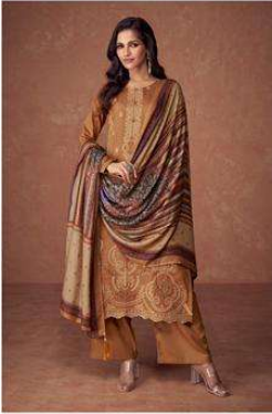
TABRIZ - 81003