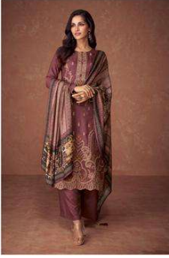
TABRIZ - 81001