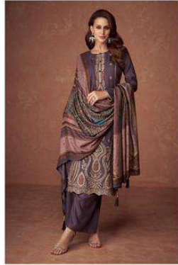
TABRIZ - 81004

منتز آرتس Muntaz Arts Passion to create THE TABRIZ COLLECTION