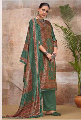
❁ 5111 B