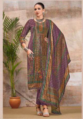
❁ 5114 B