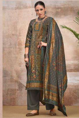
❁ 5114 A