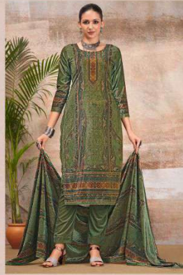
❁ 5112 B