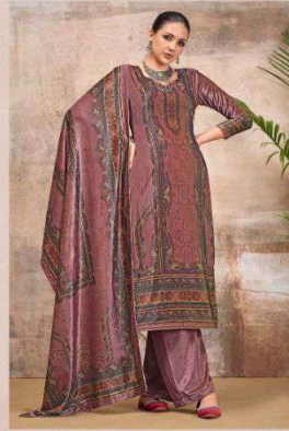
❁ 5112 A