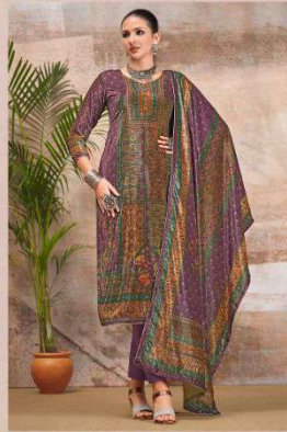
❁ 5114 B