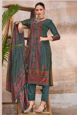
❁ 5113 B