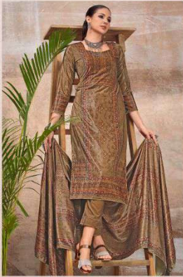
❁ 5111 A