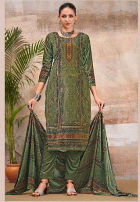
❁ 5112 B