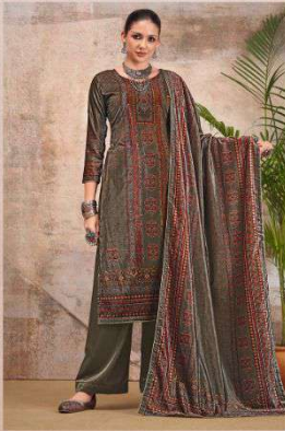
❁ 5113 A