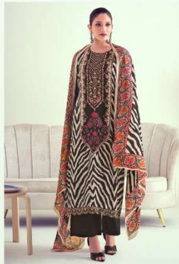
LOOK | 1506