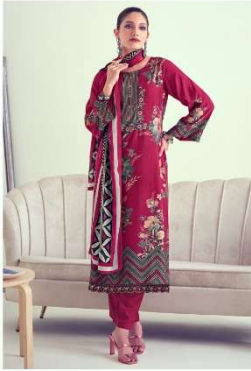
LOOK | 1503