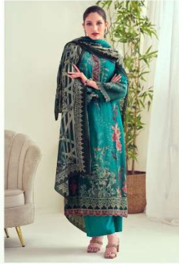
LOOK | 1504