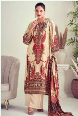
LOOK | 1505