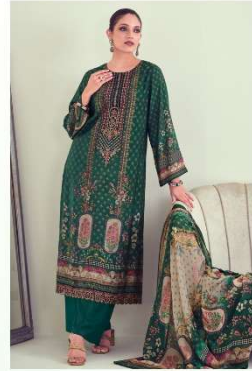
LOOK | 1508