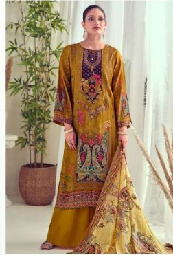
LOOK | 1507