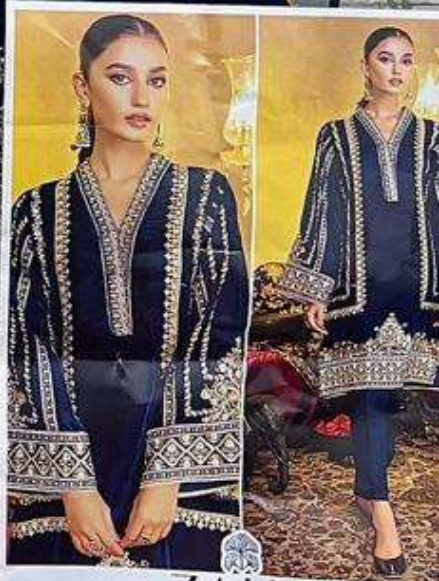
10218 MITS COLORE PURE Velvet with TOP Heavy Embroidery (Cut-2.5 Mtr.) ZAHA D.No.1021 BOTTOM-INNER Pure Rayon (Cut-2.30 Mtr.) DUPATTA Bottom Heavy Embroidery (Cut-2.30 Mtr.)