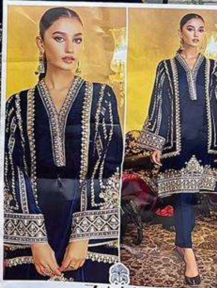
ZAHA D.No.1021 10218 MITS COLORE PURE Velvet with TOP Heavy Embroidery (Cut-2.5 Mtr.) BOTTOM-INNER Pure Rayon (Cut-2.30 Mtr.) DUPATTA Butte Heavy E (Cut-