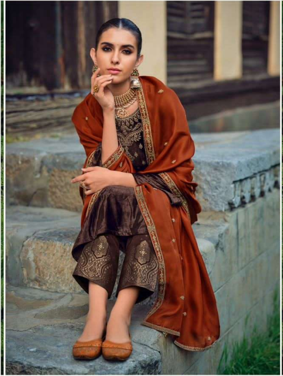
❖ D.10467 ❖