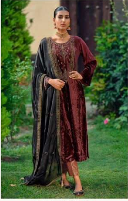
❖ D.10461 ❖