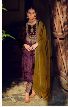
❖ D.10465 ❖