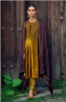
❖ D.10463 ❖