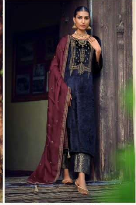
❖ D.10466 ❖