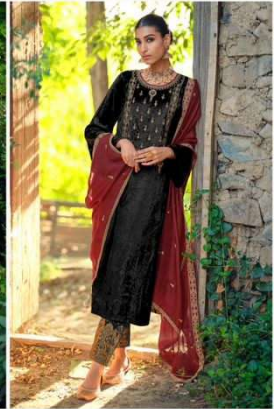
❖ D.10468 ❖