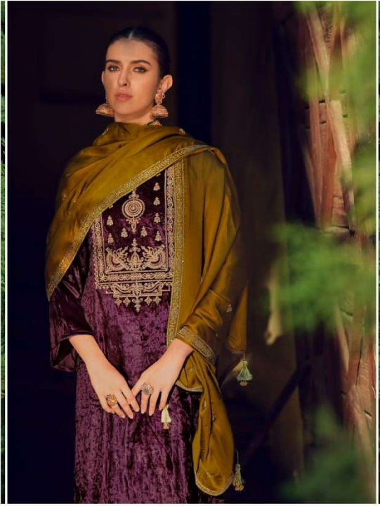
❖ D.10465 ❖