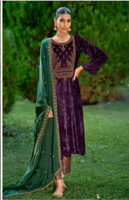
❖ D.10464 ❖