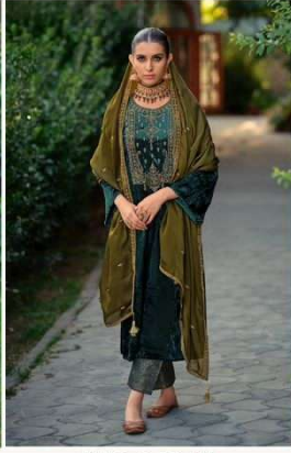
❖ D.10462 ❖