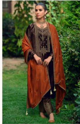
❖ D.10467 ❖