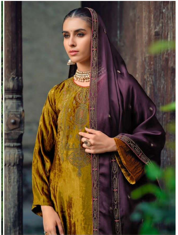
❖ D.10463 ❖