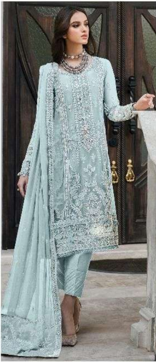
D - 5424 A