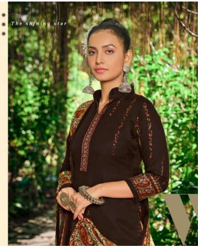
Threr she is the evening star, she shines lirst she shines brightest, and she shines longest