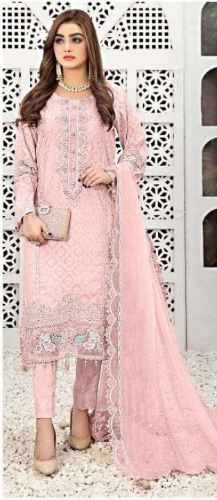
C - 1361