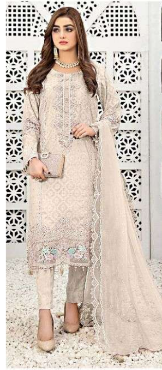
C - 1361 C