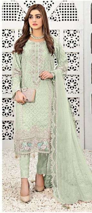
C - 1361 B