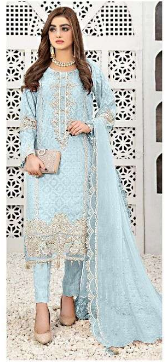
C - 1361 D