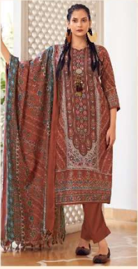
“ 855-005 ”