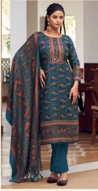
“ 855-006 ”