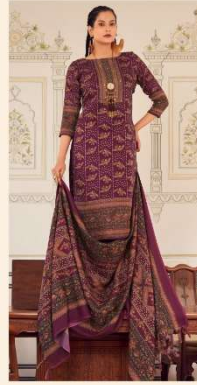
“ 855-004 ”