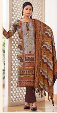
“ 855-008 ”