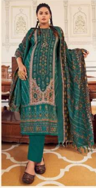
“ 855-003 ”