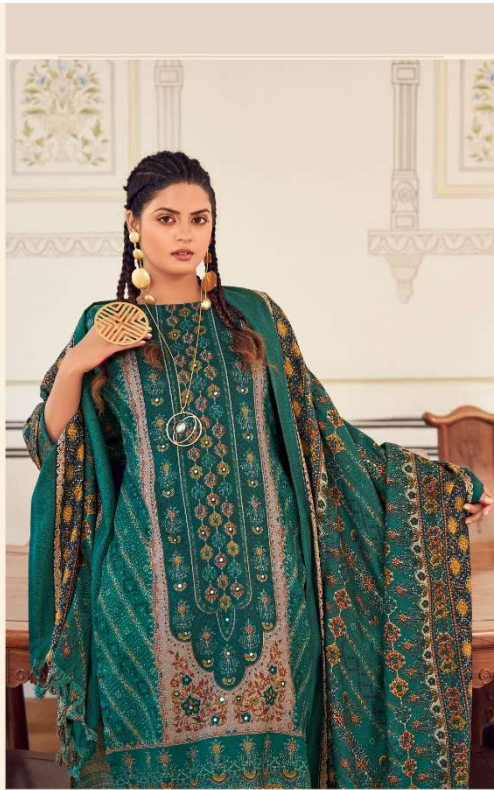
“ VINTAGE-INSPIRED LACE DRESS 855-003 ”