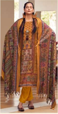
“ 855-001 ”