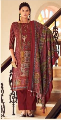
“ 855-007 ”