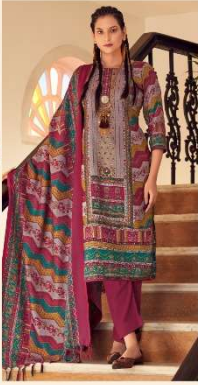
“ 855-002 ”