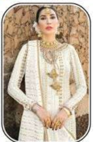
S-92 C Rose AYWOOR

WEARING INSTRUCTIONS DO NOT USE THE IR OR BLEACH ON THIS GARMENT. WASH IN COLD WATER. WASH SEPARATELY IN HAND OR MACHINE. ALL GARMENTS SHOWN - FOR 15 MINUTES. DO NOT USE HOT WATER IN WASHING OR DRYING TO AVOID SHRINKING. WASH GARMENTS AND MAKE THEM STRONG. DO NOT USE DRY CLEANING. DO NOT USE IRON IN DRESS GARMENT. * EXTRA LABEL, HANGTAGS AND ACCESSORIES ARE NOT RETURNED.