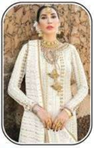
S-92 C Rose ATWOOR

WEARING INSTRUCTIONS DO NOT USE THIS IN PLACE OF YOUR WEARING INSTRUCTIONS FROM ORIGINAL PACKAGING. THESE INSTRUCTIONS ARE SUBJECT TO CHANGE & SHOULD BE KEPT FOR FUTURE REFERENCE. ALL INFORMATION IS SUBJECT TO CHANGE WITHOUT NOTICE. WEARER'S CARE AND MAINTENANCE INSTRUCTIONS DO NOT USE IN WASHING MACHINE. DO NOT USE DRYER. DO NOT BLEACH. DO NOT IRON. (EXTRA LABEL, HANGTAGS AND ACCESSORIES ARE NOT SHOWN)