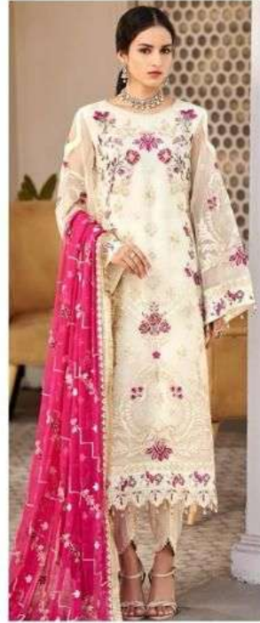
D.NO. - 16001