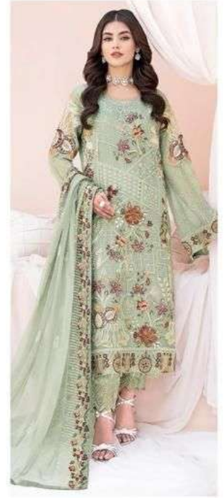
D.NO. - 16002