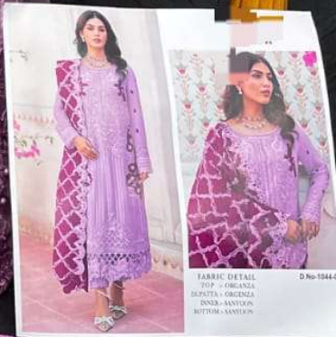
FABRIC DETAIL TOP - ORGANZA DUPETTA - ORGANZA DRESS - SATYEN BOTTOM - SATYEN D No-1944