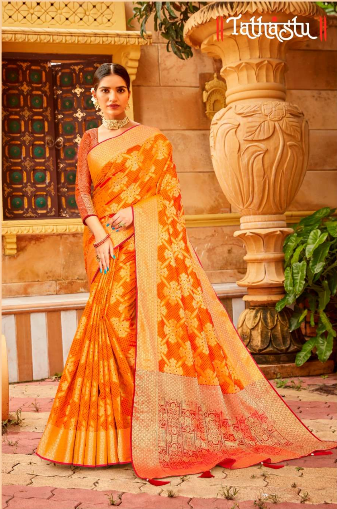
DESIGN NO. TN-57-C