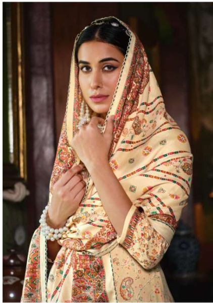
THE WORLDCHARMER | 522-001

EVERY THREAD HAS BEEN CHOSEN WITH Meticulous CARE. THE GREATEST PRECISION HAS ENSURED WHEN CREATING A DESIGN WHICH YOU WOULD LOVE UP TO HER BOUNDARY. A DESIGN DESIGNED TO FLEET BY HER BEAUTY.