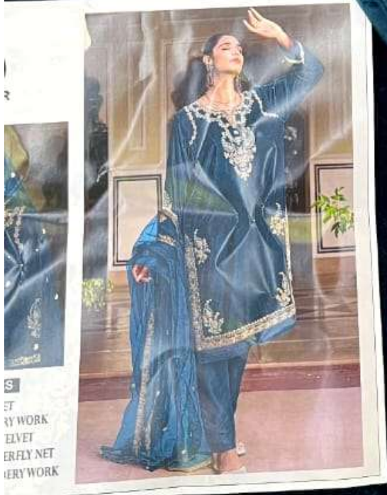
S ET RY WORK EVEY ERFLY NET ERY WORK