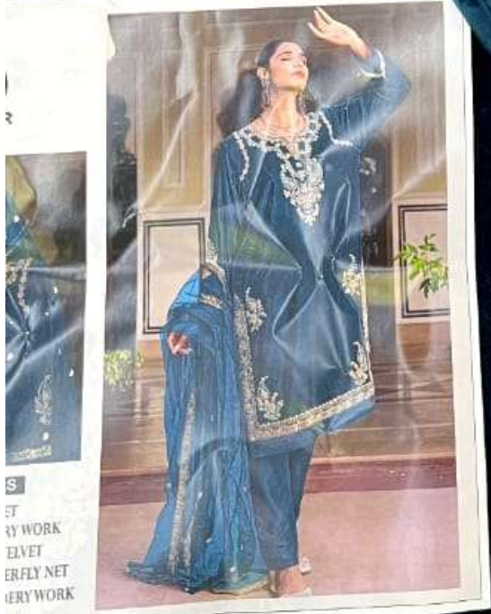
S ET RY WORK EVEY ERFLY NET ERY WORK