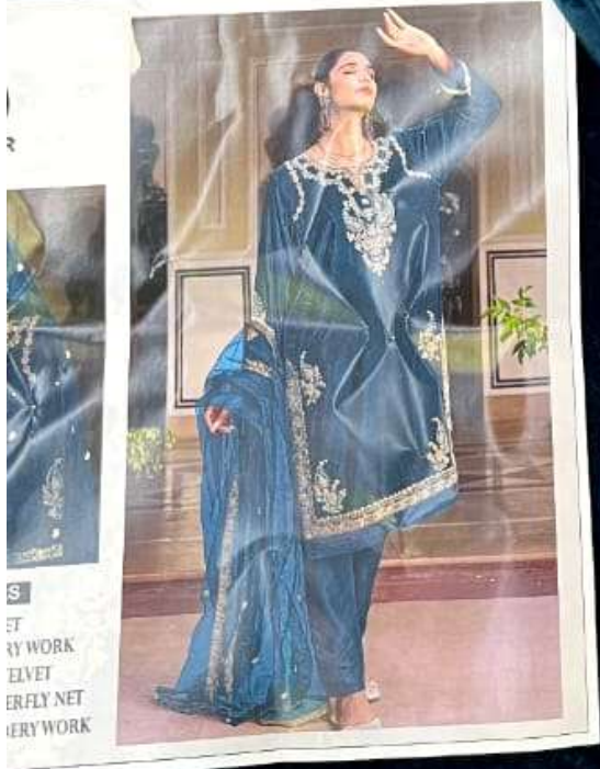
S ET RY WORK EVEY ERFLY NET ERY WORK