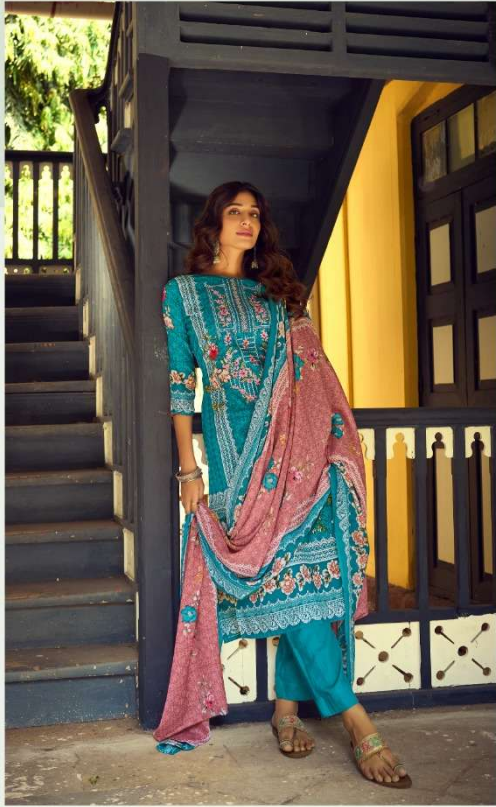
Simplicity a current trend that you sport with a personal take