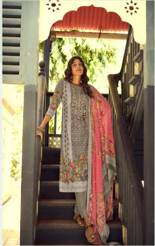
Fabulous vibrant tones to give any look an adrenaline rush