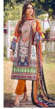
D.NO / 858-005