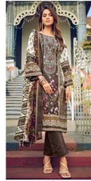
D.NO / 858-010