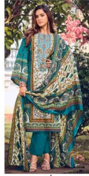
D.NO / 858-004