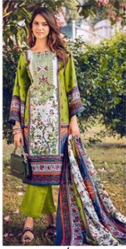
D.NO / 858-002