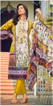
D.NO / 858-006