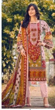
D.NO / 858-003