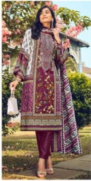
D.NO / 858-007