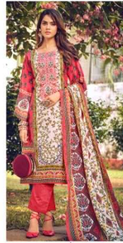
D.NO / 858-009