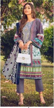
D.NO / 858-001