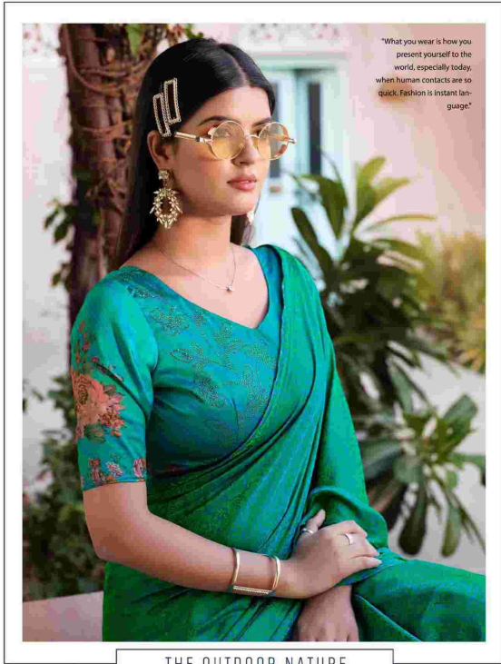
THE OUTDOOR NATURE